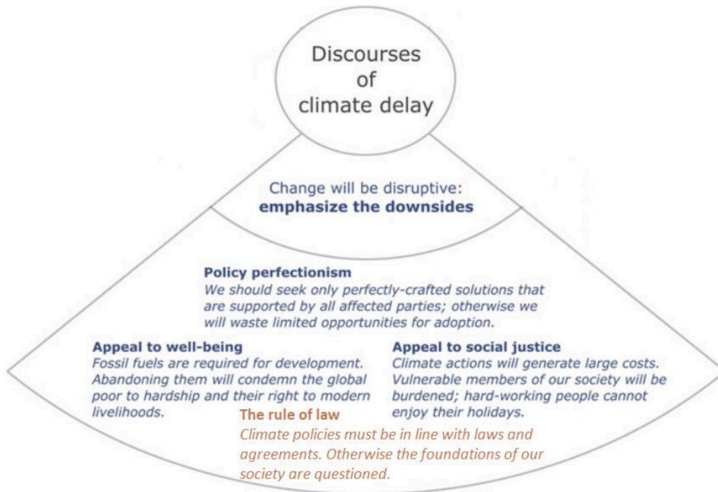
Fig. 2. Our suggested addition to the framework developed by Lamb et al. (2020). New sub-category “The rule of law” in brown added to “Emphasize the downsides” category.

direct responsibility to mitigate climate change towards countries with higher emissions and greater financial means. By pointing at low domestic (per-head) emissions, actors in these countries derive a right to emit more from existing global inequalities (see Fig. 3).